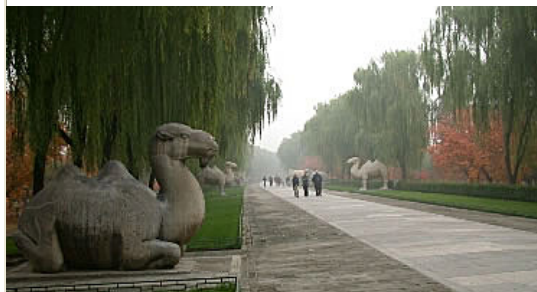
Sacred Way with stone statues

We shall take a full day excursion to the Great Wall located at the suburb of Beijing. The Great Wall of China has witnessed Chinese history for over 2000 years. Put your foot on a few steps or hike along to the top, you will fulfill your dream: "I have conquered the Great Wall"! Stretching 4500 miles from east to west of China, the grand wall construction began during the Warring States Period (403 to 221 BC). The Great Wall was a fortification along the northern and northwestern frontier of China, with an inner wall running southward to the vicinity of Beijing. In 221 BC, after conquering six States, the first emperor of the Qin dynasty erected the largest portion of the wall as a defense against raids by nomadic peoples. Today, the Great Wall becomes one of the 8 th Wonders in the world attracting millions of travelers annually from all corners on earth.